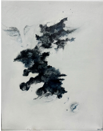
the end of winter oil emulsion on canvas