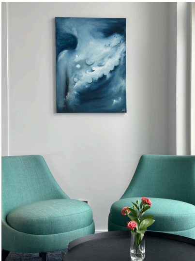
The origin of the night oil on canvas